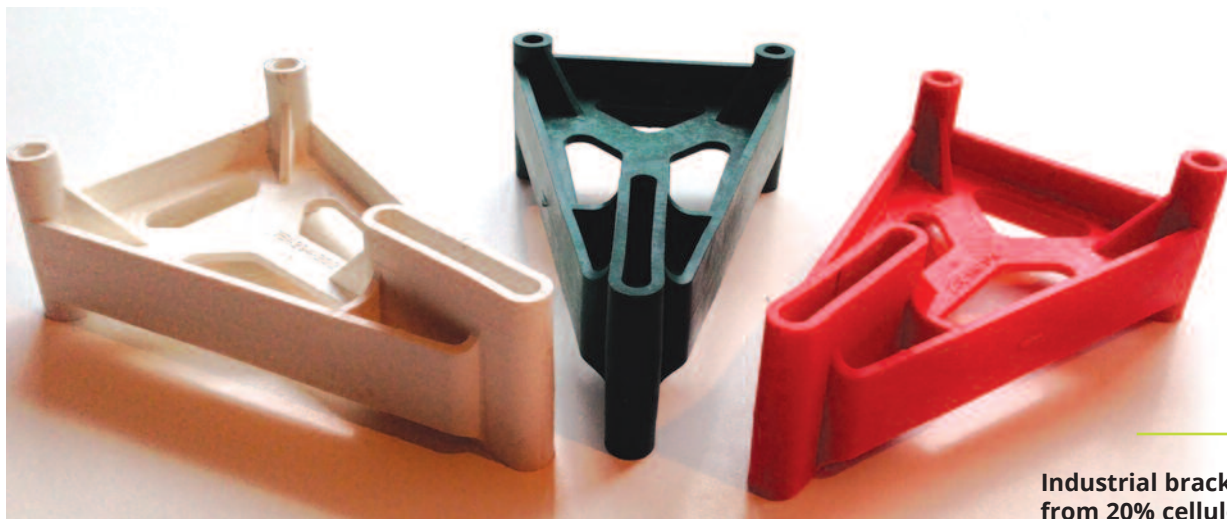
Industrial bracket made from 20% cellulose-filled PP