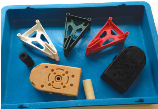
Collection of industrial fluid housings, brackets, end caps, and a large tray—all molded of cellulose-filled polypropylene

Based on these results and market acceptance, Weyerhaeuser is currently working to expand this proprietary technology to polymeric families beyond polypropylene.